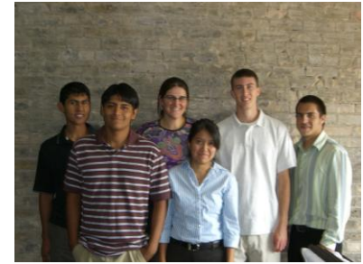
2007 Navigate Summer Founding-Fellows

NAVIGATE young adults are committed to develop themselves as leaders. NAVIGATE young adults learn to speak on behalf of immigrant communities to leaders in higher education. One NAVIGATE leader said, “I was nervous to meet a College Dean and to speak to someone who was not an immigrant about the barriers that students like me are facing. After speaking, it was good to know that there are people who are willing to help us.”